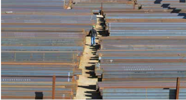
▲ All of Infra-Metals' facilities collectively have 150,000 tons of steel in inventory at any given time.