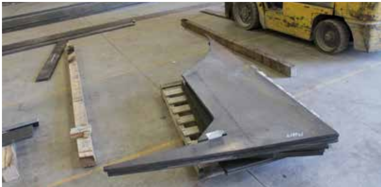
▲ The plate-processing machine can accommodate plate up to 10 ft wide and more than 60 ft long. ▼ The blast and paint line at the company's Connecticut facility.